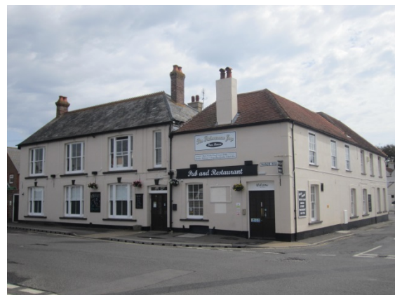
Fisherman's Joy Public House